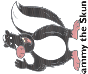
Sammy the Skunk